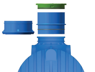
Extension of an inspection chamber with rings or telescopic extensions